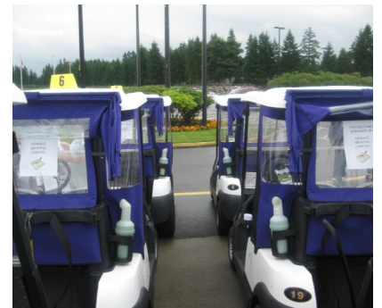
Ready to Roll