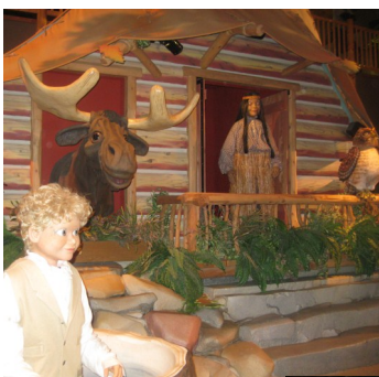
Story Time at Great Wolf Lodge