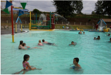
Stewart Heights Pool in Tacoma